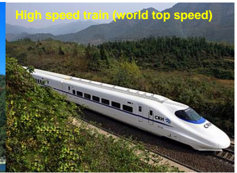
High speed train (world top speed)